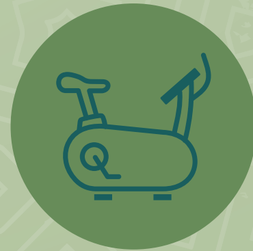
Gym & Indoor Games